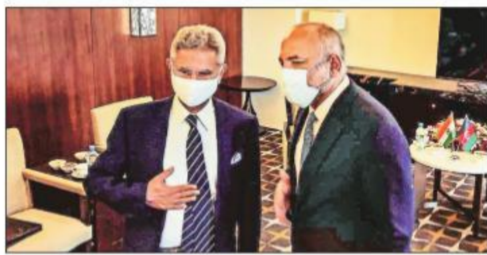
Jaishankar with Afghan counterpart Mhd Haneef Atmar in Dushanbe

Jaishankar called for "ceasing violence and terrorist attacks against civilians and state representatives", settlement of conflict "through political dialogue", respect