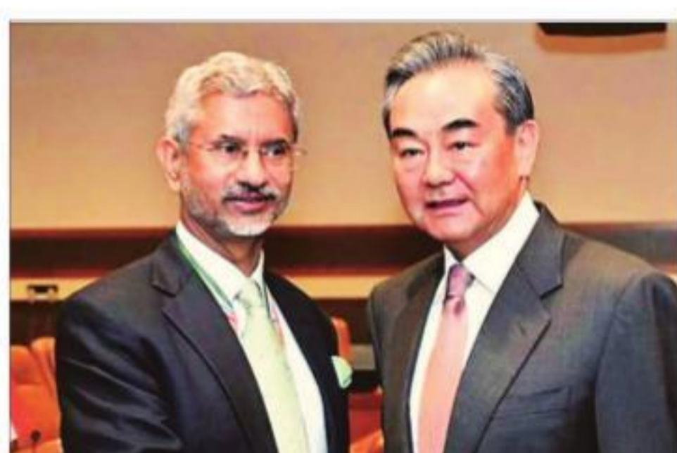
External affairs minister S Jaishankar with Chinese state counselor and foreign minister Wang Yi

In a series of tweets, Jaishankar said the discussions focused on the outstanding issues along the LAC in eastern